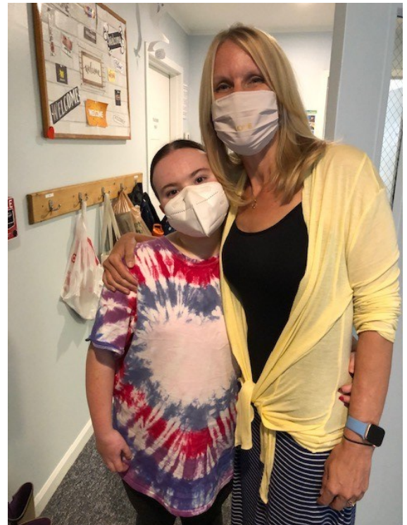
School Principal and Student