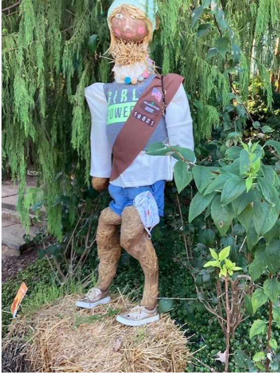
Miss Thin Mint