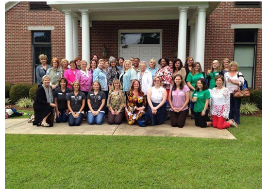
2013 GFWC GA LEADS graduates