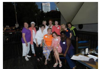
BBQ for the USO!