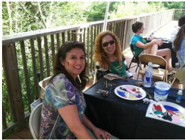
Flying Colors Butterfly Festival

Please enjoy some photos of our summer activities!