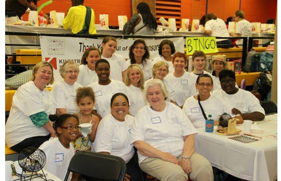
Georgia Justice Project: Back-to-School Bash