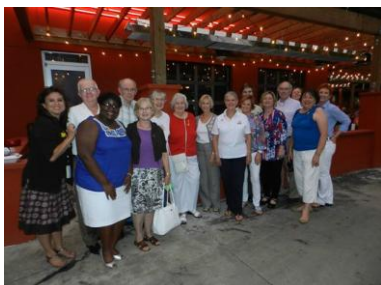
Social Night Out