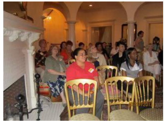
After Hours Membership Meeting

www.gfwc.org/gfwc/Join_Our_Mailing_List.asp