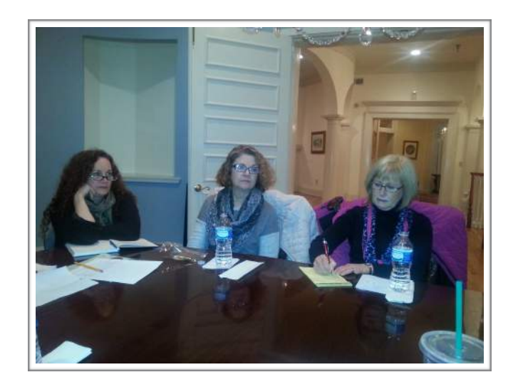
Peachtree Women's Writer's Alliance meeting at the Wimbish House