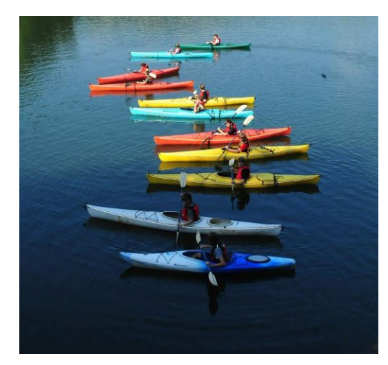
Students take advantage of the available resources in the area. Pictured are one of the classes learning how to handle a water craft on the still waters of Tallulah Lake, located directly behind the school.