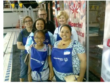
Volunteers worked hard to cheer the Special Olympics athletes on at a May event!

Members spent one Saturday afternoon in May volunteering at the Special Olympics. You can continue to show your support by participating in its Duck Derby on June 21 at Six Flags White Water park. Making a $5 donation, your duck will race with other ducks. Prizes will be awarded to ducks coming in first through fifth places, but more importantly 24,470 Special Olympics Athletics will benefit from your generosity. To adopt: http://www.specialolympicsga.org/adopt-your-duck-for-5/