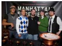
bars & clubs »