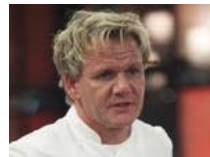
movies & tv »