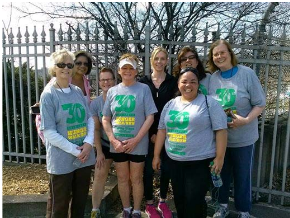
The Wimbish Walkers!

Once again The Atlanta Woman's Club will volunteer at the upcoming summer games for the Special Olympics held on Saturday, May 31 st from 11:30 a.m. to 5:00 p.m. at Emory University. The event is free to anyone that wants to watch the games. As volunteers, we are asked to fill a 2 hour shift. Last year we had several members volunteer who truly enjoyed seeing the smiles on their faces of the Special Olympic Athletes when they participate in the games. It was a wonderful heart-warming experience. We hope more of you will be able to join us this year. Details will be provided once you sign up. We will be notified by May 9 th of where you will be working. Thank you so much for your participation in helping the Special Olympics have successful State Summer Games this year.