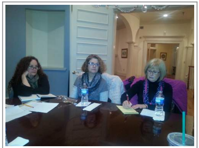
Peachtree Women's Writer's Alliance meeting at the Wimbish House