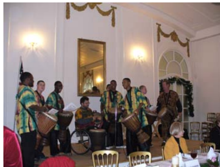
Above, the students of Youth Villages at Inner Harbour play for members at Dec. meeting