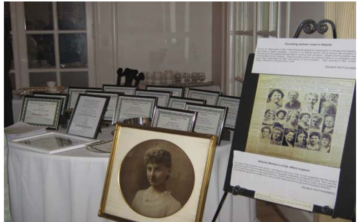
Above:Display featuring plaques & awards won by AWC