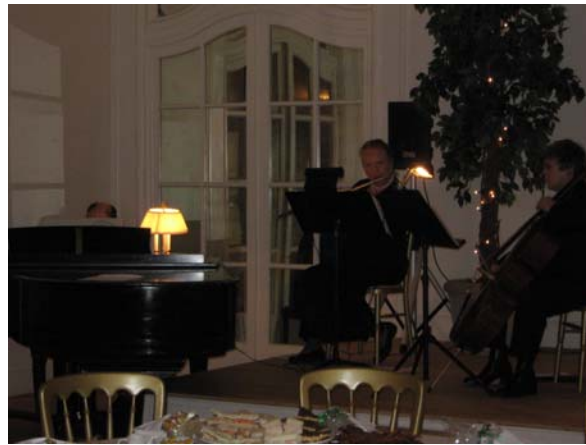
The Wind & Wood Chamber Players